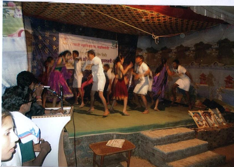
The Volunteers of NSS unit are performing a cultural programme in village Yewali Dist-Gadchiroli Session 2012-13