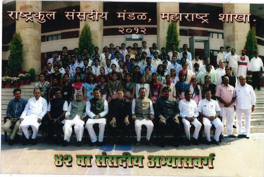
A Student of M. A. final year was participated in Maharashtra Branch of Rashtrakul Sansadiya Mandal Session 2012-13