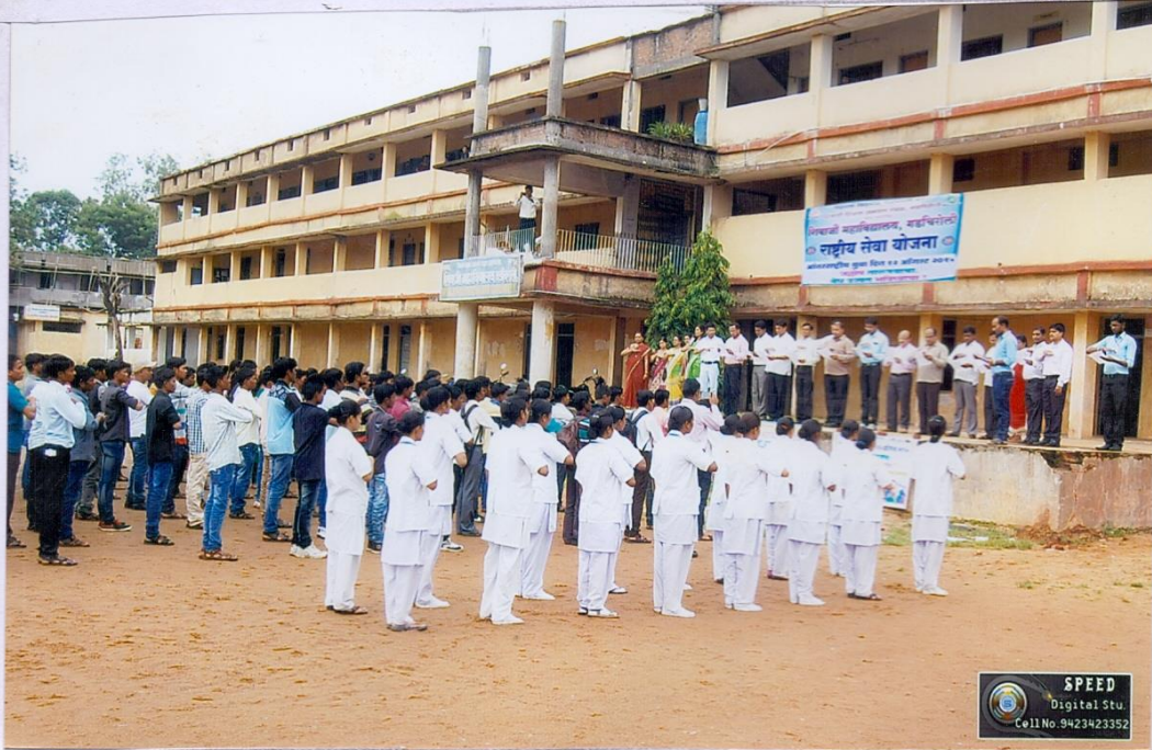
Taking an oath on 'Body Organ Donation' by the college. Session 2013-14