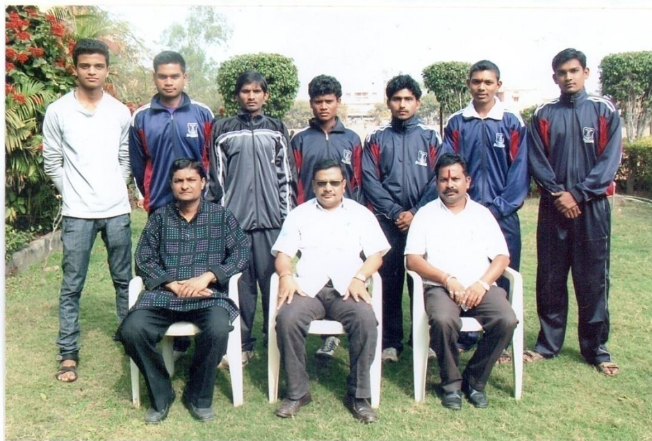
SELECTED COLLEGIATE PLAYERS FOR THE VARIOUS TEAMS OF GONDWANA UNIVERSITY,GADCHIROLI. SESSION.2013-14