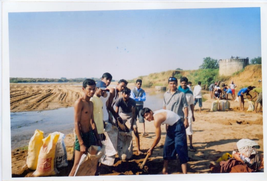
Sand Dam Built Developed on Kathani river by N.S.S. Unit.