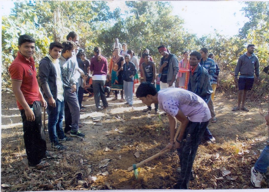
NSS volunteers cleaned road and dirty areas in the village Kurhadi in the Session 2013-14