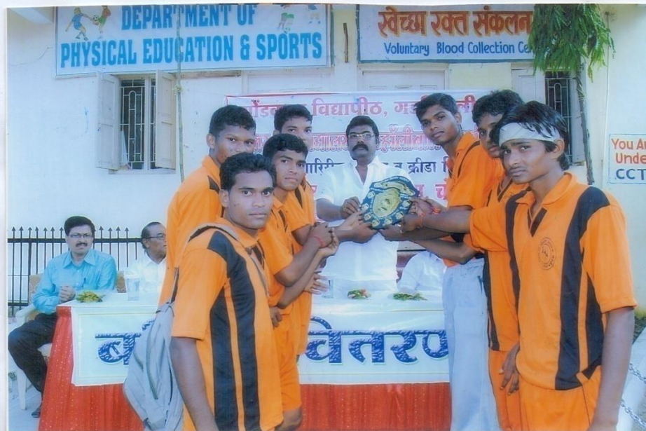
THE PLAYERS EMERGE SECOND WINNER IN INTER COLLEGE VOLLEYBALL COMPETITION. SESSION:2014-15