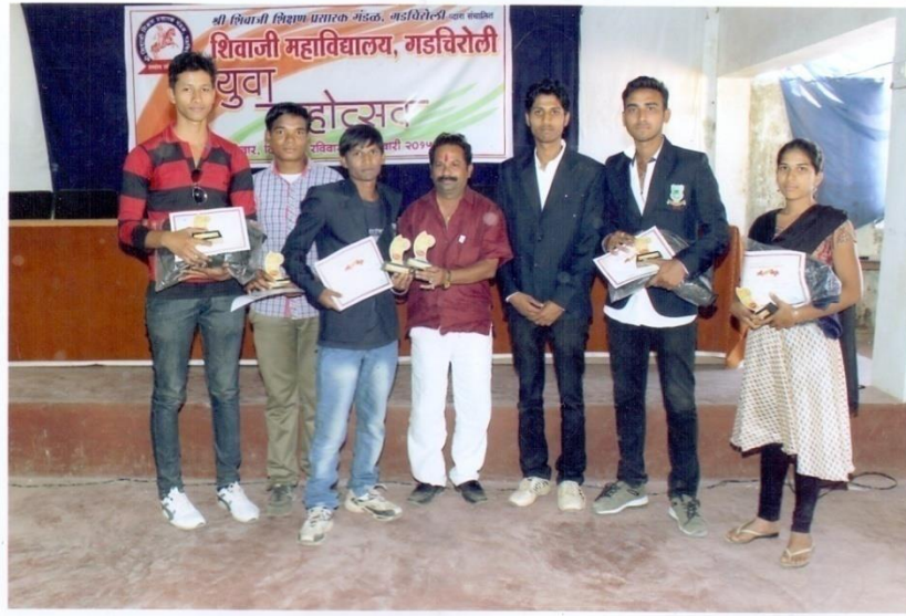
AWARDED BOXING CHAMPIONS FOR SELECTION OF GONDWANA UNIVERSITY GADCHIROLI, ON THE OCCASION OF YOUTH FESTIVAL.SESION-2014-15