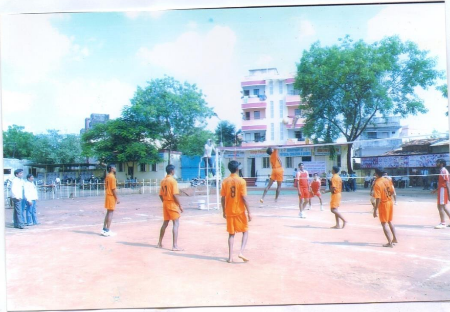
THE PLAYERS ARE PLAYING VOLLEY BALL IN INTER-COLLEGE COMPETITION SESSION 2014-15