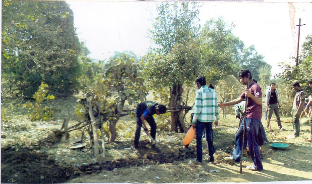
The Cleanliness Drive by NSS unit in adopted village Kurhadi in the Session 2014-15