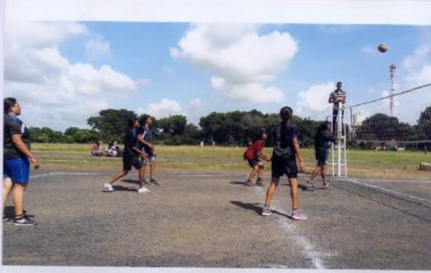
महाविद्यालयाचा महिला संघ वरोरा येथे आंतर महाविद्यालयीन व्हॉलीबॉल स्पर्धेमध्ये खेळताना