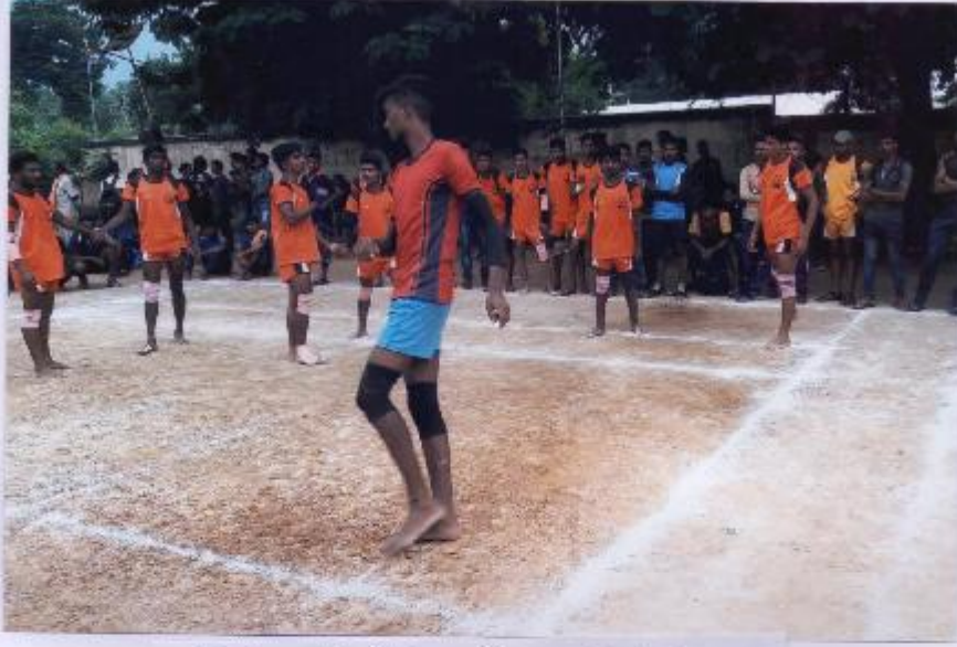
विद्यापिठ स्पर्धेमध्ये विसापूर येथे कबड्डी संघ खेळताना