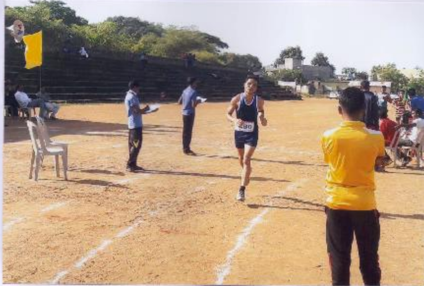
महाविद्यालयाचा खेळाडू आंतर महाविद्यालयीन ऑथलेटीक्स स्पर्धेत भागताना