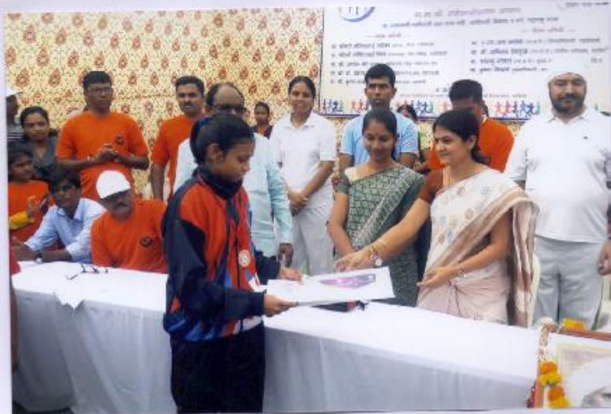
मेंढारथॉन स्पर्धेत प्रथम बक्षिस स्विकारताना महाविद्यालयाची विद्यार्थीनी