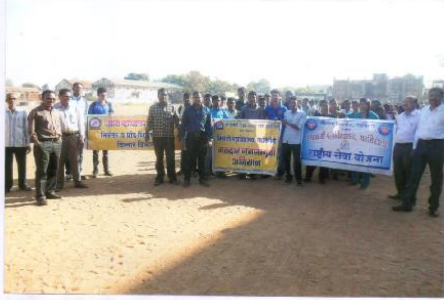
अभियान रॅली मध्ये सहभागी, निरंतर व प्रौढ आणि विस्तार विभाग, राष्ट्रीय सेवा योजना व मतदान जनजागृती चे विद्यार्थी व विभाग प्रमुख