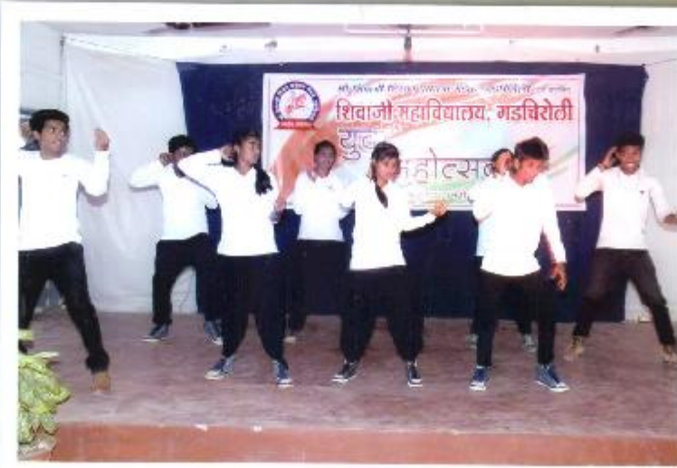
समुह नृत्य सादर करताना विद्यार्थी