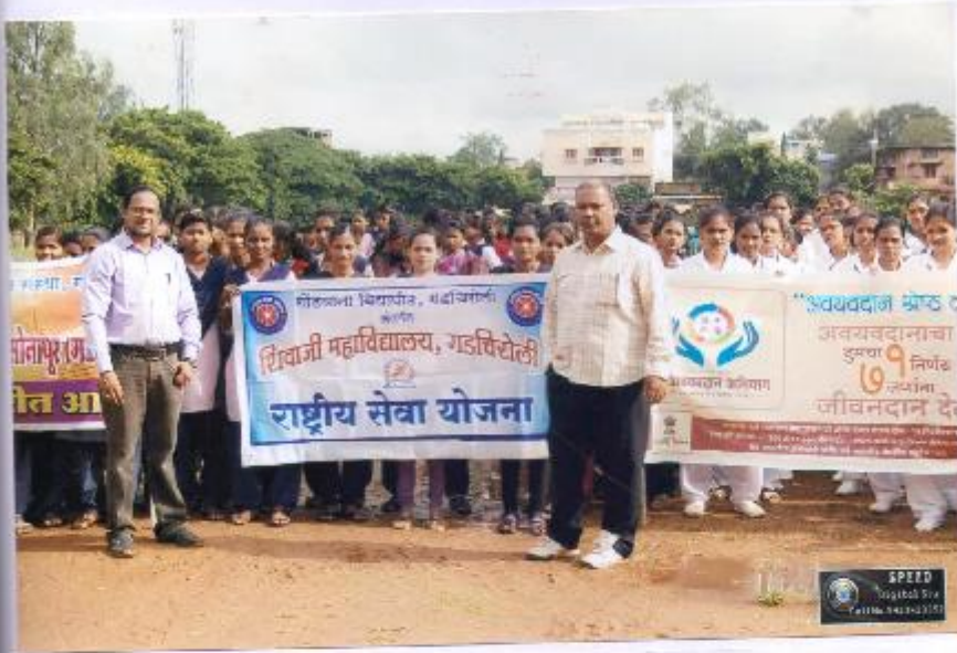
अवयव दानाविशयी जनजागृती करतांनी महाविद्यालयीन विद्यार्थी