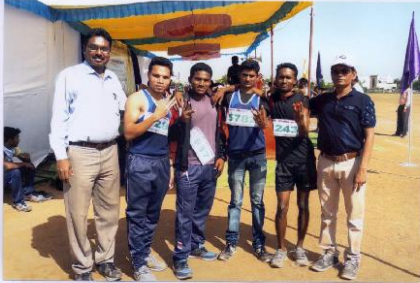
आंतर महाविद्यालयीन अॅथलेटिक्स स्पर्धेत विजयी खेळाडू व क्रिडा शिक्षक