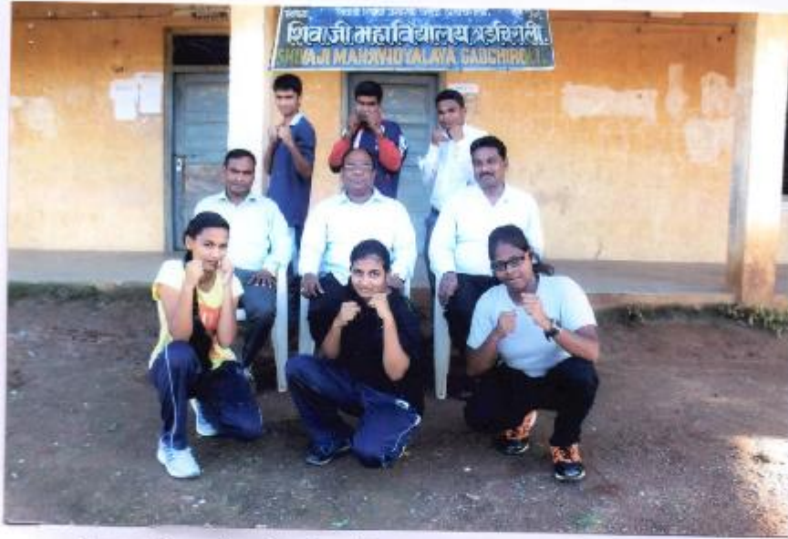
आंतर महाविद्यालयीन बॉक्सिंग स्पर्धेत विजयी खेळाडूंसोबत प्राचार्य व किडा शिक्षक