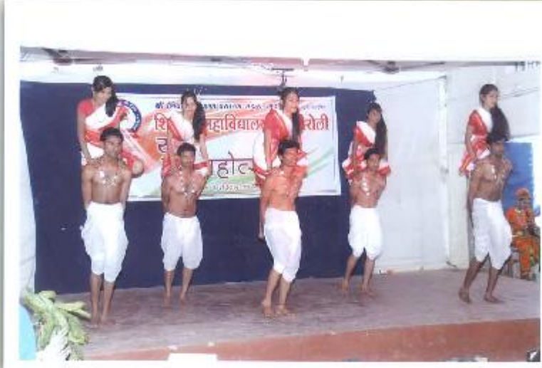
आदिवासी नृत्य सादर करताना विद्यार्थी