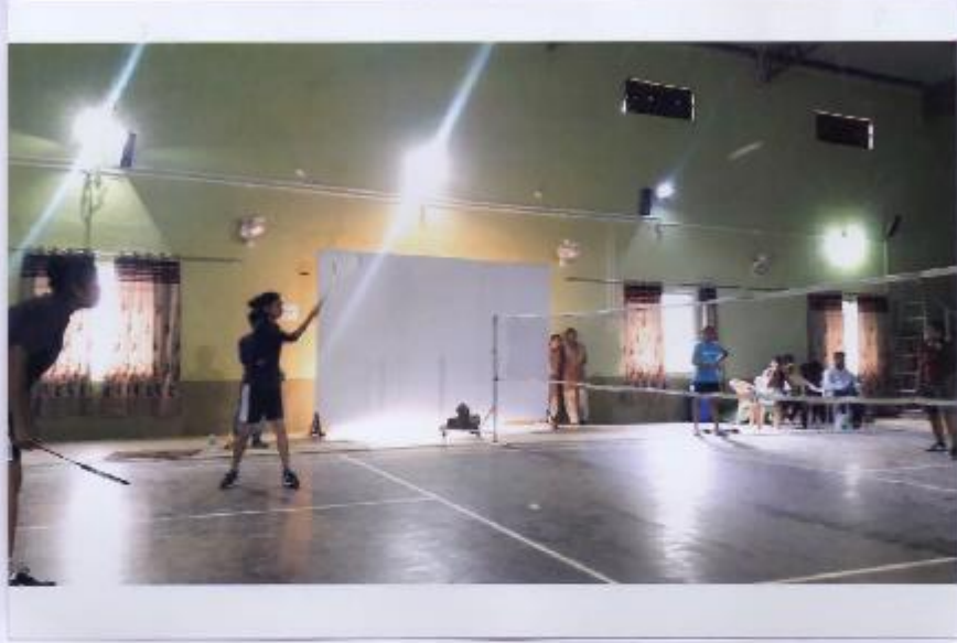
वरोरा येथे आयोजित आंतर महाविद्यालयीन बॅडमिंटन स्पर्धेत महाविद्यालयाचा संघ खेळताना