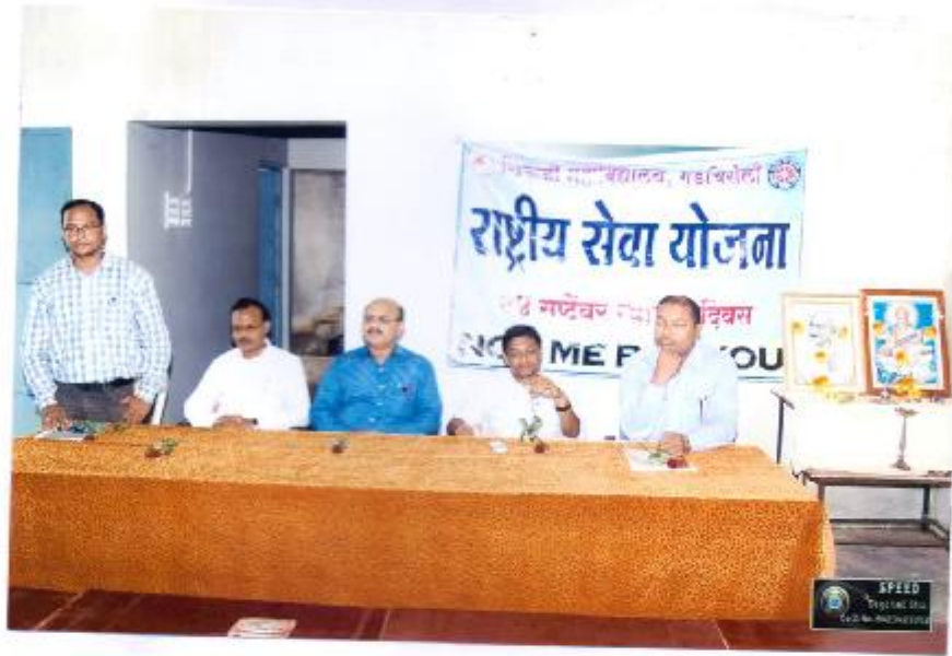
महाविद्यालयात राष्ट्रिय सेवा योजना दिन साजरा करतांना