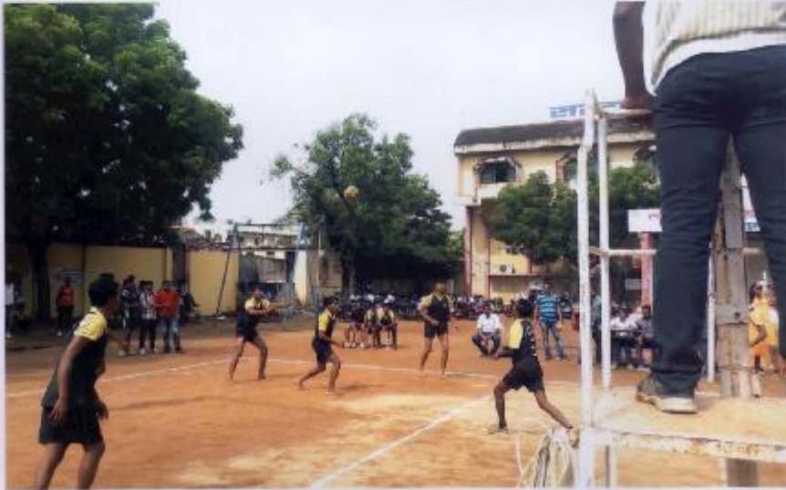
महाविद्यालयाचा पुरुष संघ चंद्रपूर येथे आंतर महाविद्यालयीन व्हॉलीबॉल स्पर्धेमध्ये खेळताना