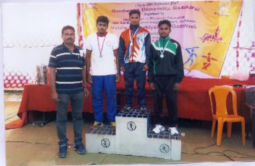
आंतर महाविद्यालयीन स्पर्धेत प्रथम पारितोषिक विजेता खेळाडू