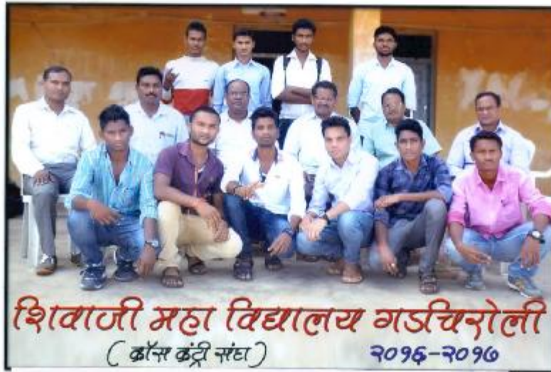
शिवाजी महा विद्यालय गडचिरोली ( बॉक्स कंट्री संघ ) २०१६-२०१७